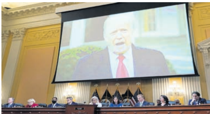
A video of President Donald Trump is shown on a screen, as the House select committee investigating the Jan. 6 attack on the U.S. Capitol holds a hearing at the Capitol in Washington, July 21, 2022.